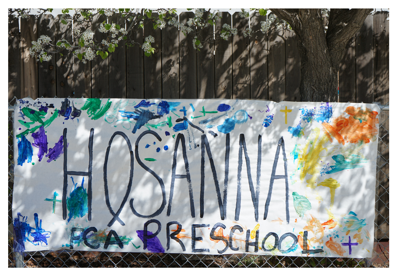
Preschool Art Project for March Chapel, 2024