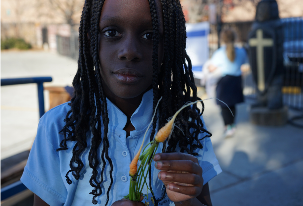
Carrot Harvest, Garden of Faith, 2023.