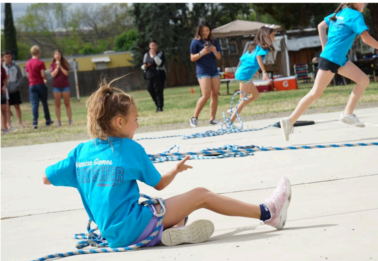
Warrior Games, 2024